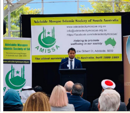
Adelaide Mosque Open Day