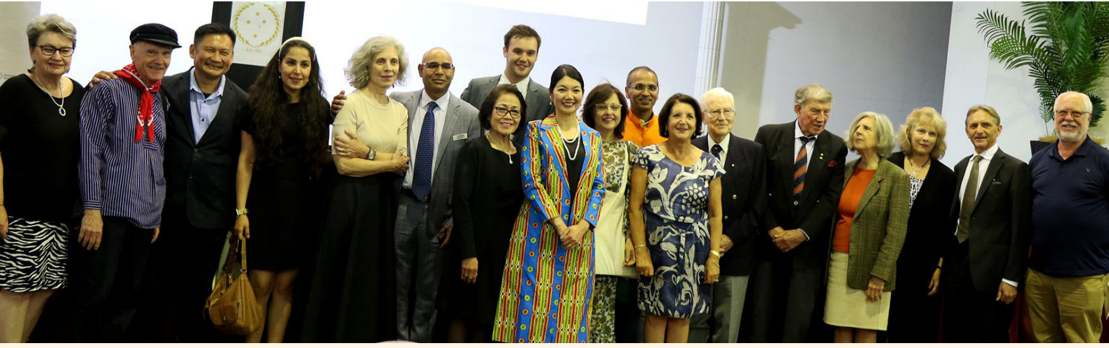
MCCSA AGM 2019