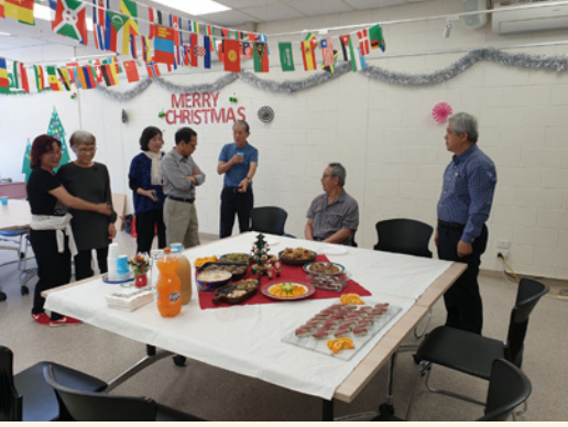
MCCSA end of year celebrations for our CVS volunteers and Korean Seniors Group