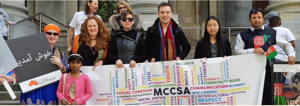
MCCSA at the annual Walk Together event