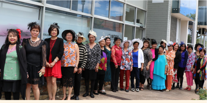
Kapamilya - Filipino Association celebrating Melbourne Cup Day at MCCSA Hub