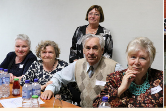
MCCSA Annual General Meeting 2016