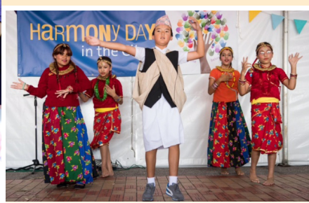
Harmony Day in the City