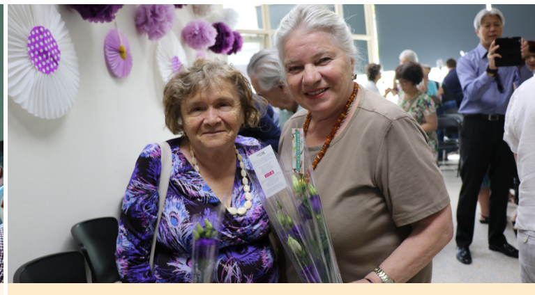
International Women's Day morning tea at MCCSA