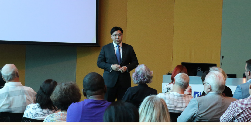
\ensuremath{\mathsf{MCCSA}} Forum to discuss changes to 18\ensuremath{\mathsf{c}}