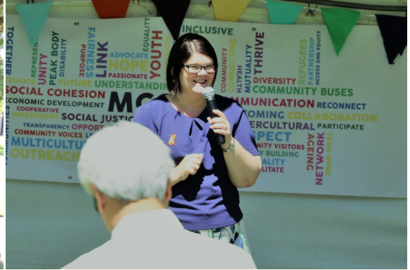
Harmony Day in the City