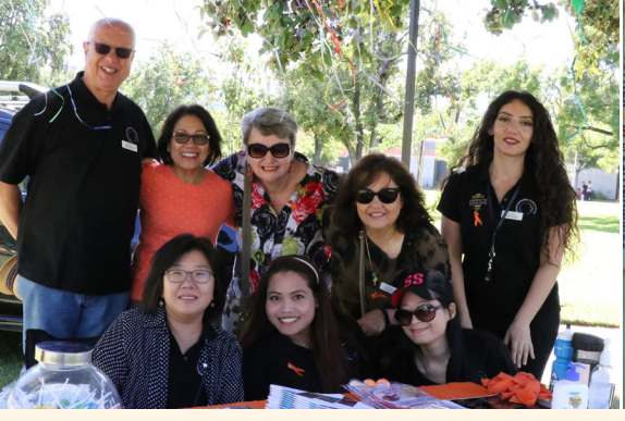
MCCSA's Harmony Picnic in Whitmore Square